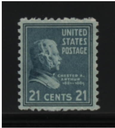
Chester A. Arthur