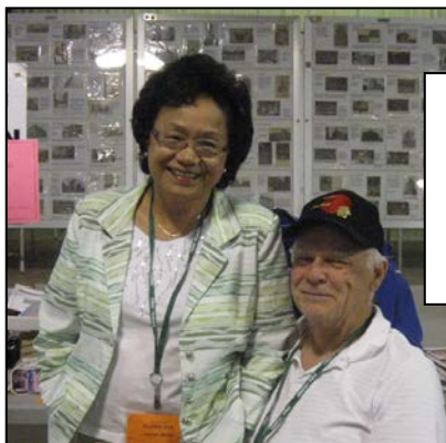
Rising Sun, FLOREX booth holder and CFSC members