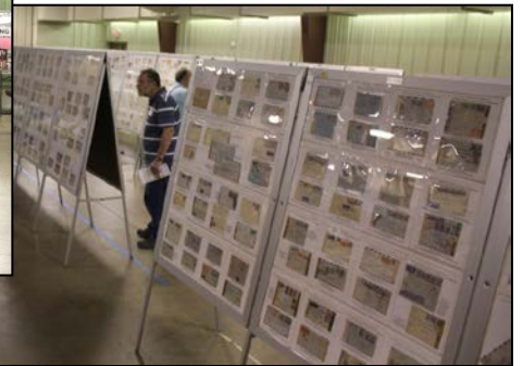
180 frames of exhibits