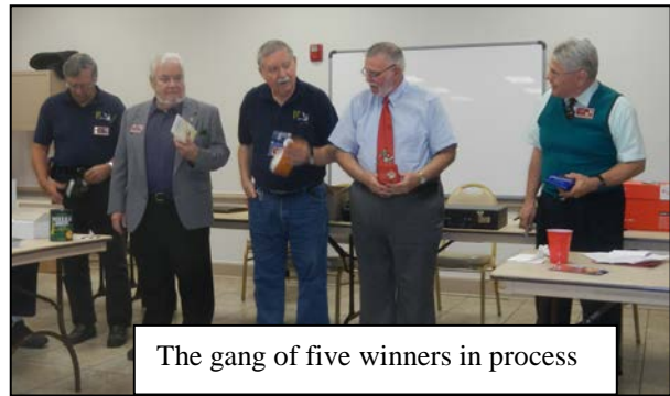
The gang of five winners in process