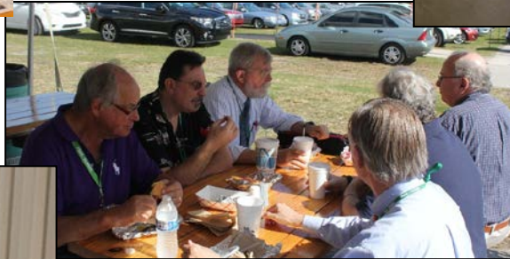
APS Judges enjoying lunch and exhibit winners