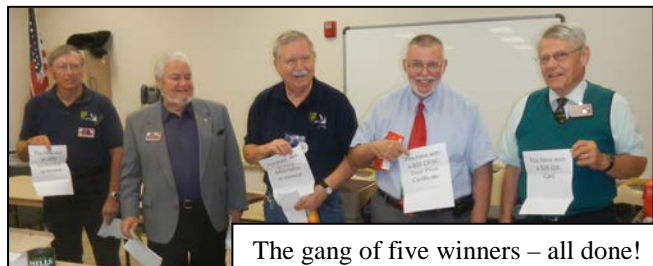
The gang of five winners – all done!