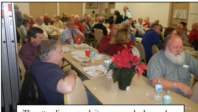
The attending crowd, it was a packed room!