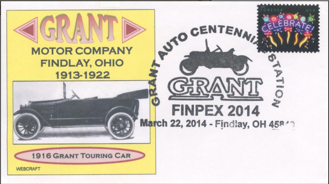
The second cover is a philatelic souvenir of 2014 celebrating the Grant Motor Company for FINPEX in Findlay, Ohio.