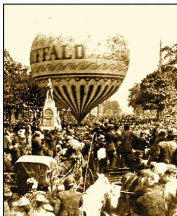
The balloon before an ascension in Cleveland, Ohio