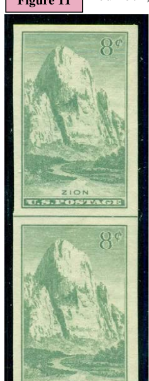
Figure 11 Red rock, slot canyons, steep mountain sloops and stunted trees struggle for survival. I had the

pleasure of visiting the north area in 2007 and found it much more peaceful and quieter than the more popular south area. The north area is for communing with nature, the south area is for views that words can't describe. I am in awe of the splendor of Zion NP and place it in my top five favorite parks. One of my best memories of traveling in a national park