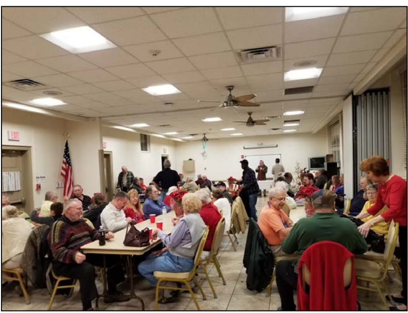
The room is full and everyone is well fed!

The 2018 Holiday Gathering went off without a hitch. Thank you to everyone who participated in such a wonderful bonding event. A total of 57 signed in, which included many spouses and even one grandchild!