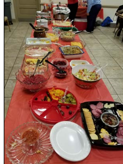
The great variety of food was laid out for all to feast.