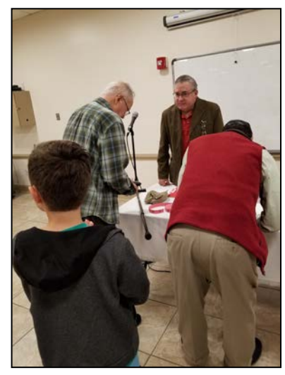
Raffle tickets being sold.