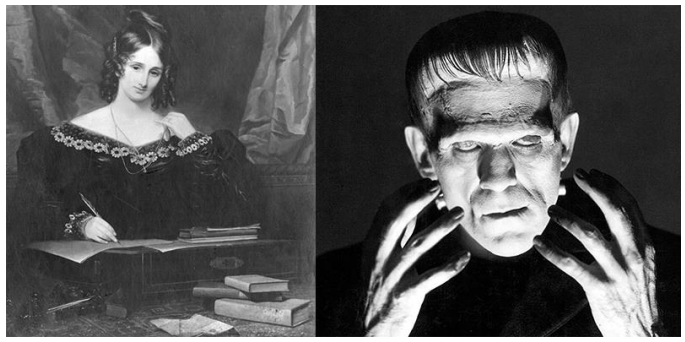
Frankstein cover with March 17, 1866 handstamp used on Prussian (Scott No. 17) stamp. Mary Shelly and Boris Karloff as Frankenstein

Frankenstein is a city located in Lower Silesia in southwestern Poland. It was founded in the second half of the 13th century by the first settlers from Franconia, the historical land of Germany on the middle of the Rhine. In 1945, it was renamed Zabkowice Śląskie (German: Frankenstein in Schlesien ).