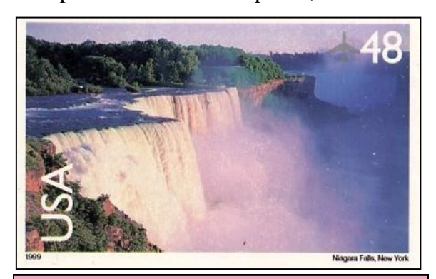
Figure D7 above, D8 below

Ann and I have raised 17,000+ butterflies from eggs, all released in our yard. Ann collects the eggs and caterpillars from our host plants, feeds and cares for them in cages and we release them after they emerge. I do