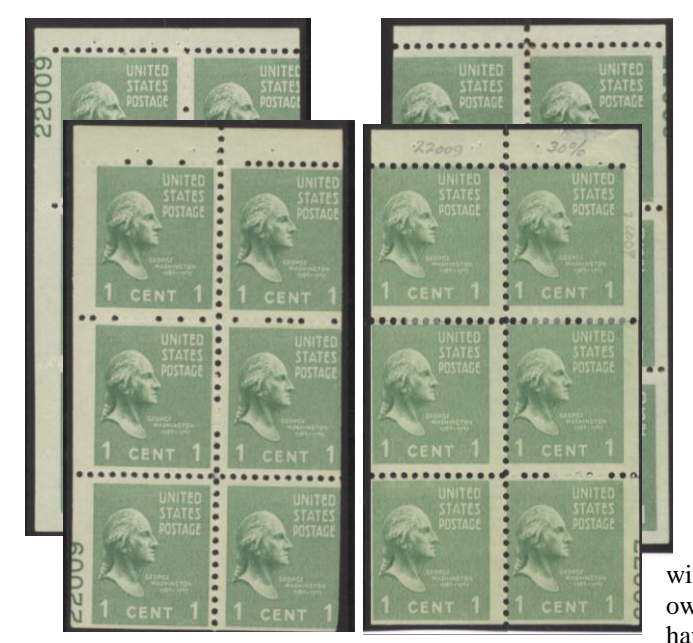
Plate numbers on booklet panes can be most interesting and frustrating to determine. The Durland's reference catalog along with the Prexy reference books are a most. The simple fact is – if you find a plate number on a booklet pane, it is because of a failure in the production finishing process has occurred. After nearly 15 years of collecting this material this is my only complete set. I do have two other plate numbers with three of the four positions. The ever-elusive lower right position always seems to be the sticking point.

For reasons I can not even begin to explain the miscuts found most often involve the left side of the pane. Any miscuts found on the right side are difficult to impossible to obtain.