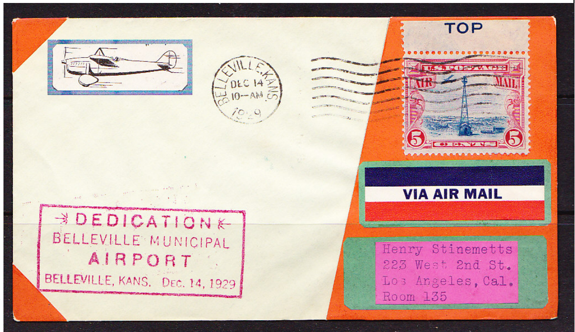
Figure (1) illustrates how Henry Stinemetts prepared covers during the 1920's & 1930's. His creations are probably each unique as he used pieces of silk or paper to design his "cachet". I met a nice couple at a stamp show who purchased almost every Stinemetts cover I had. They stated they are working on a book on his methods. Stinemetts worked as a janitor in post offices and other buildings. He searched the trash he was emptying for items to use on covers. Sometimes, the filler is part of a restaurant menu you would love to order from today!