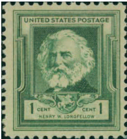
Figure A1 to A5