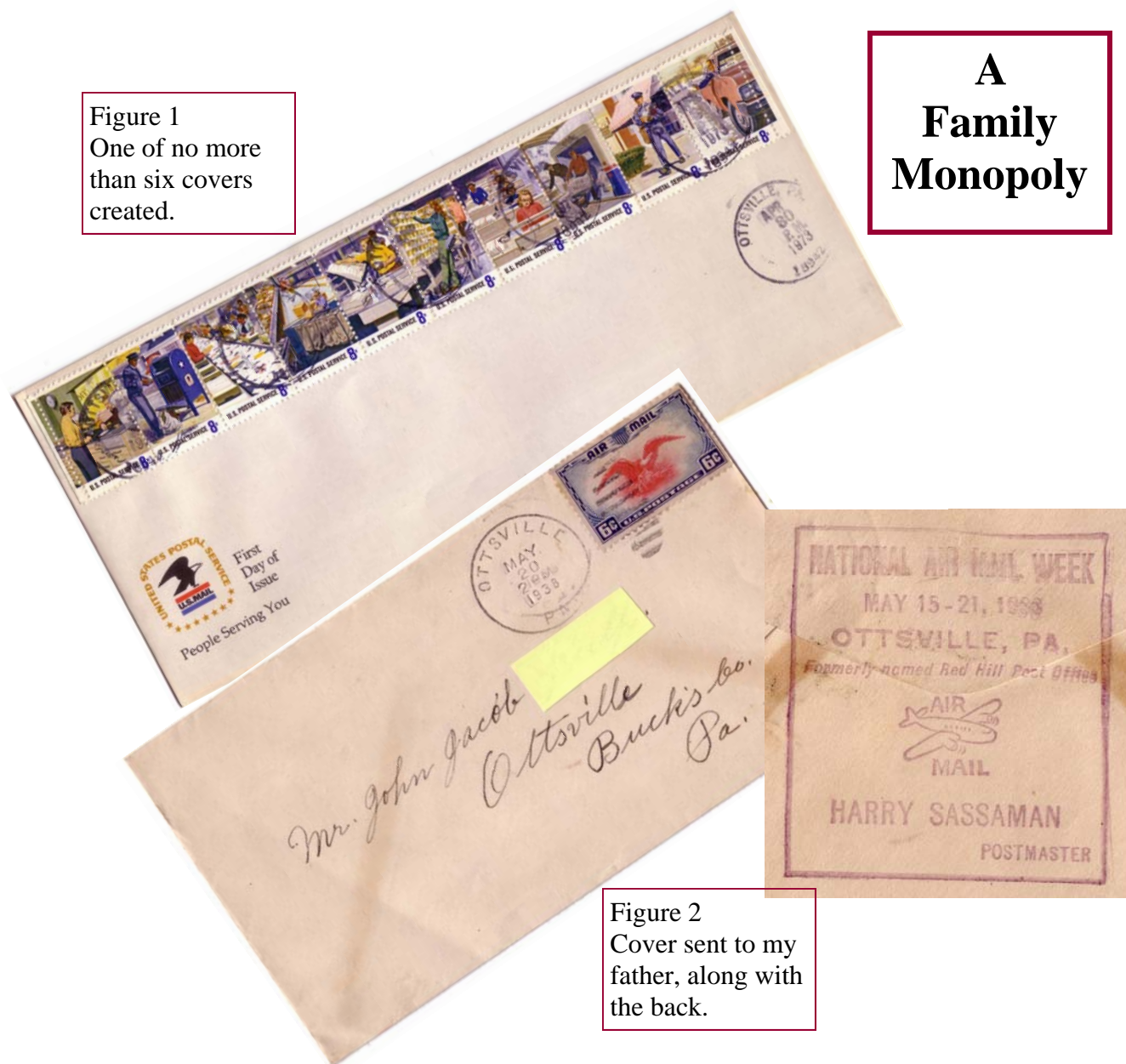
Figure 2 Cover sent to my father, along with the back.