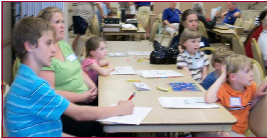
Youth Nite May 2010